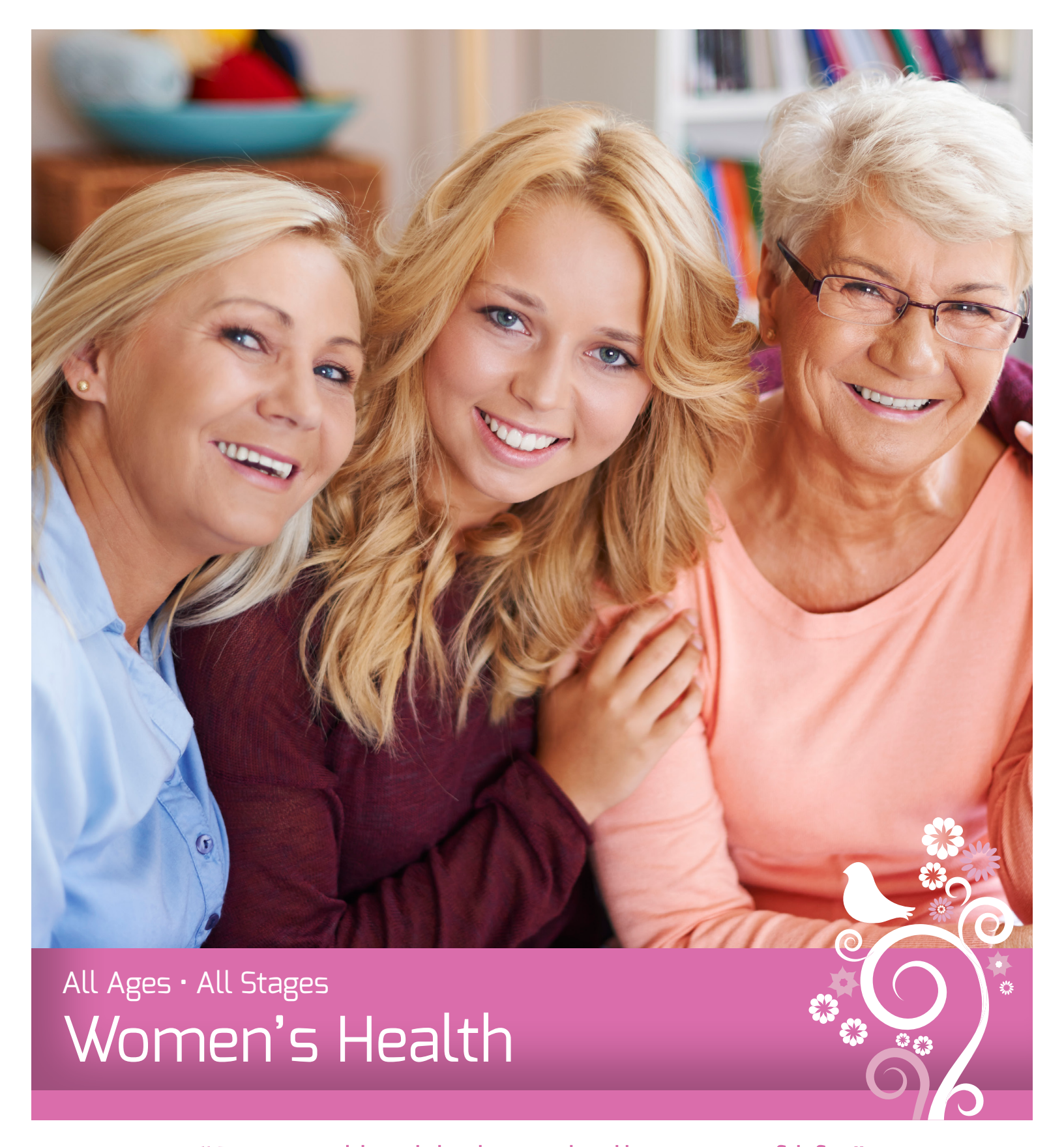
"For good health through all stages of life."